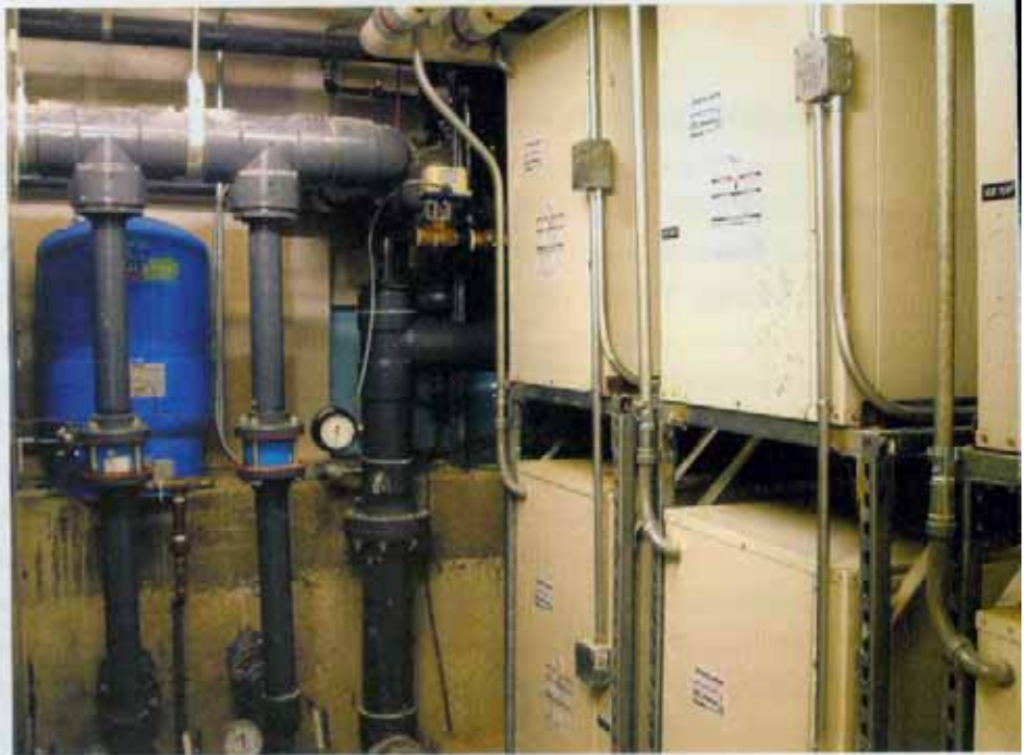
The GSHP system for Harvard Grammar School's renovation is run on electricity generated by a solar photovoltaic system.

Solar photovoltaic (PV) systems are becoming a natural complement to some GSHPs. In this particular