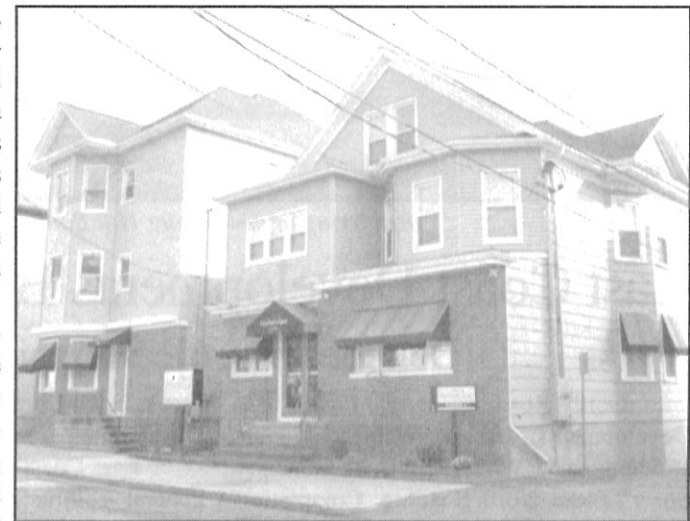
Newly expanded Cabral-Baylies Funeral Home

A new, two-level addition connects the two buildings and includes a garage, an